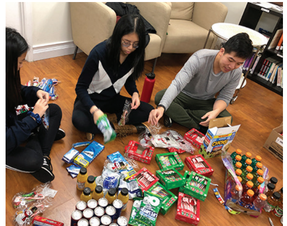
Shop and deliver gifts to homeless shelter and new immigrant families