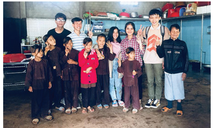
Get school supplies and food for orphans; play, cook and eat with them