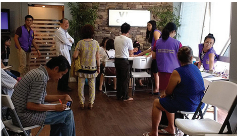
Host and organize health fairs for so that underprivileged people have access to basic health checks and vaccines