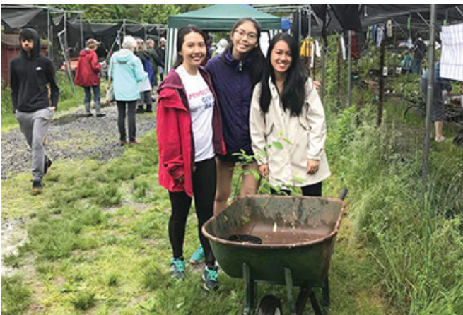
Preserve the environment by volunteering with other local nonprofits