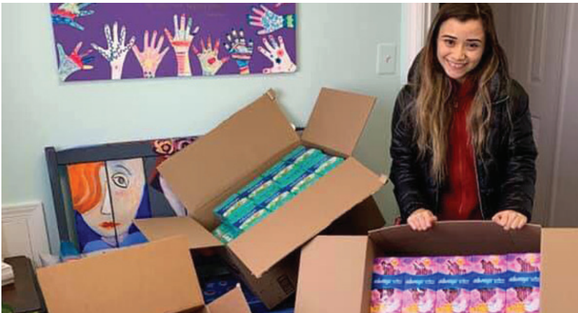
Host fundraisers to offer feminine hygiene products to shelters and organizations in Northern Virginia