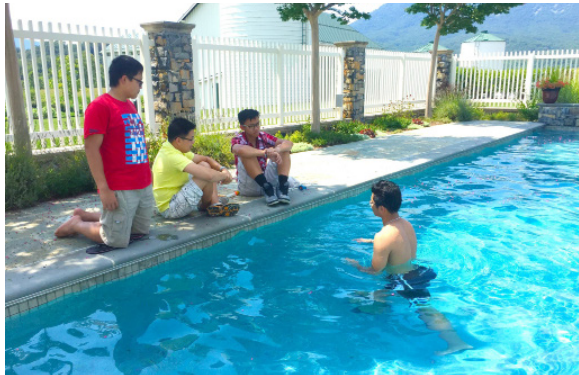
Summer Retreat at the White House Farm Foundation