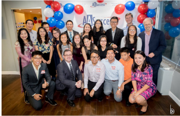
AASuccess 10th year Anniversary