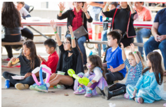
Family Fun Day 2017